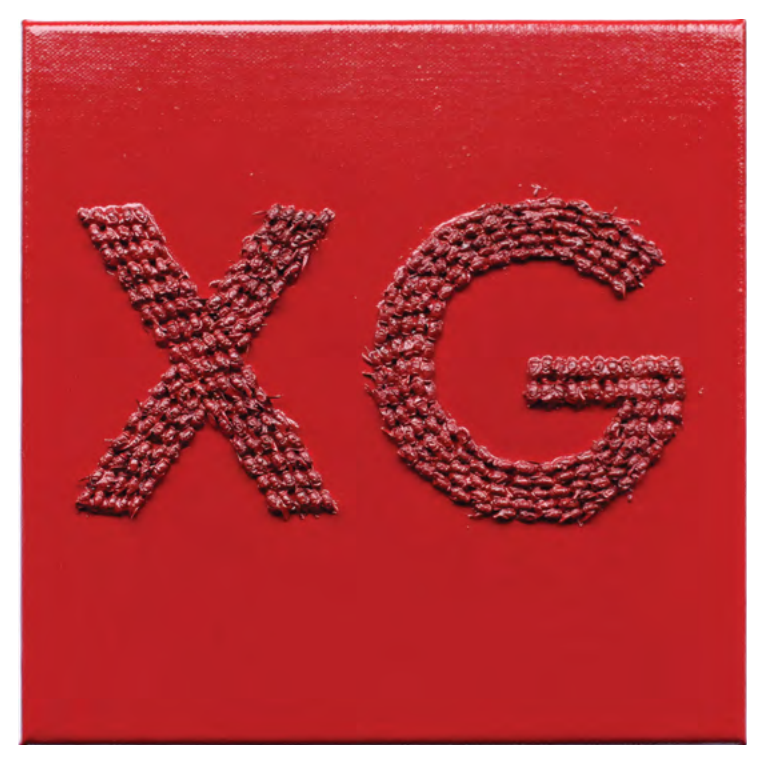
Split 3.2, 2016, Preserved flies, paint and acrylic on canvas, H228 x W228 mm 分裂3.2,2016,布面丙烯、防腐蒼蠅、油漆,長228 x 寬228 mm

In this time permeated with change and conflict, we see the old familiar atmosphere slowly leave us. In our hearts we cannot help but feel a sighing that we cannot express. One can hardly avoid asking "Is it all over for Hong Kong, or is new hope waiting for us just around the corner?" These works express my view in the form of contrasts. In the time from the return until today, society has become increasingly polarized. Everywhere you look there are scenes of conflict. I wonder as I watch the familiar Hong Kong getting farther and farther away, will there be a day when we are no longer "Hong Kong", just a Chinese city called "Xiang Gang."