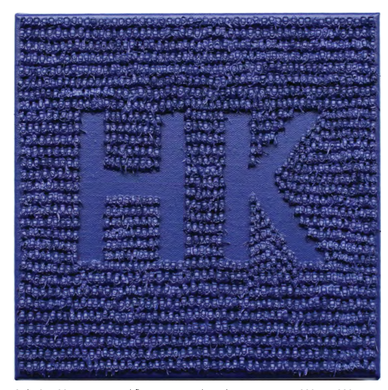
Split 3.1, 2016, Preserved flies, paint and acrylic on canvas, H228 x W228 mm 分裂3.1,2016,布面丙烯、防腐蒼蠅、油漆,長228 x 寬228 mm

《分裂4.1》:用的圖案為HK(香港英文簡稱),而《分裂4.2》:用的圖案是XG,香港普通話拼音。