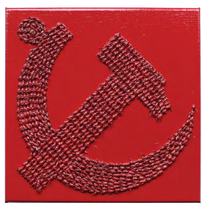
Split 2.2, 2016, Preserved flies, paint and acrylic on canvas, H228 x W228 mm 分裂2.2,2016,布面丙烯、防腐蒼蠅、油漆,長228 x 寬228 mm