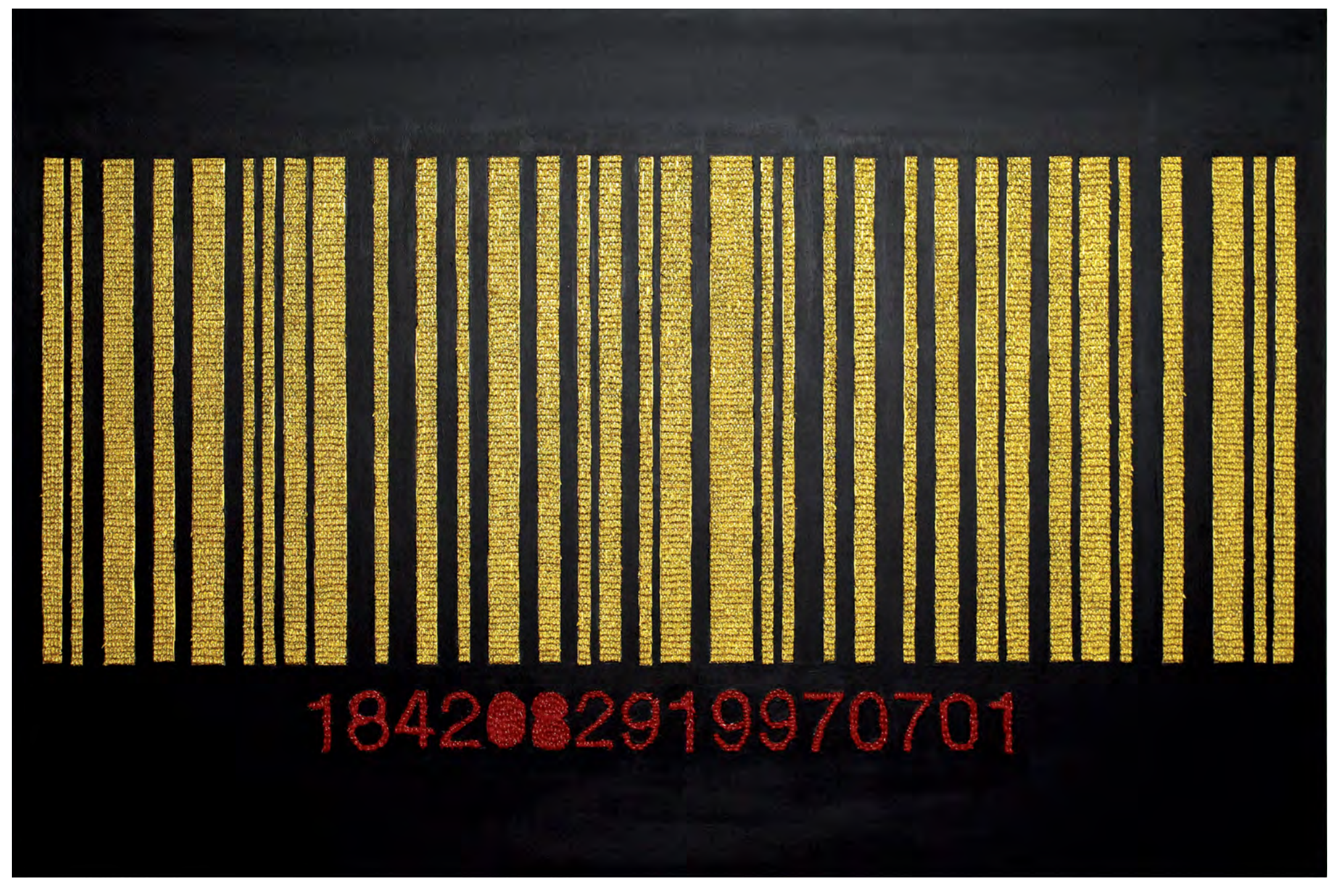
Hongkong\ Barcode , 2016, Preserved flies, paint and acrylic on canvas, H1000 x W1500 mm 香港條碼,2016,布面丙烯、防腐蒼蠅、油漆,長1000 x 寬1500 mm