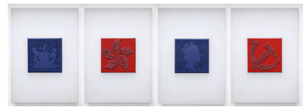
Split 1 - 4, 2016, Preserved flies, paint and acrylic on canvas with acrylic frame, H640 x W450 mm 分裂1-4,2016,布面丙烯、防腐蒼蠅、油漆,亞加力外框,長640 x 寬450 mm

The symbolism appears through conflict, pairing the use of rises and depressions to express the colonial period moving farther away and the things that have come into Hong Kong since 97. Symbols once familiar to Hong Kong may now be gradually leaving us, gradually becoming just a memory floating in our minds. We see new symbols slowly beginning to surround us, and cover up the old history.