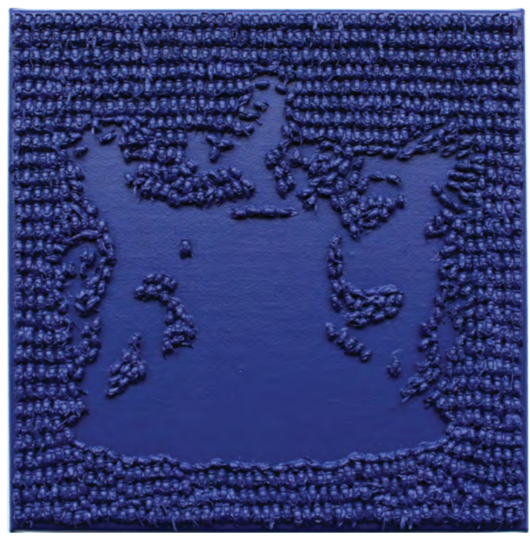
Split 1.1, 2016, Preserved flies, paint and acrylic on canvas, H228 x W228 mm 分裂1.1,2016,布面丙烯、防腐蒼蠅、油漆,長228 x 寬228 mm