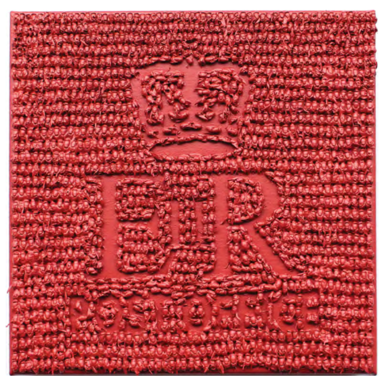
Split~3.1,~2016, Preserved flies, paint and acrylic on canvas, H228 x W228 mm 分裂3.1,~2016,布面丙烯、防腐蒼蠅、油漆,長228 x 寬228 mm