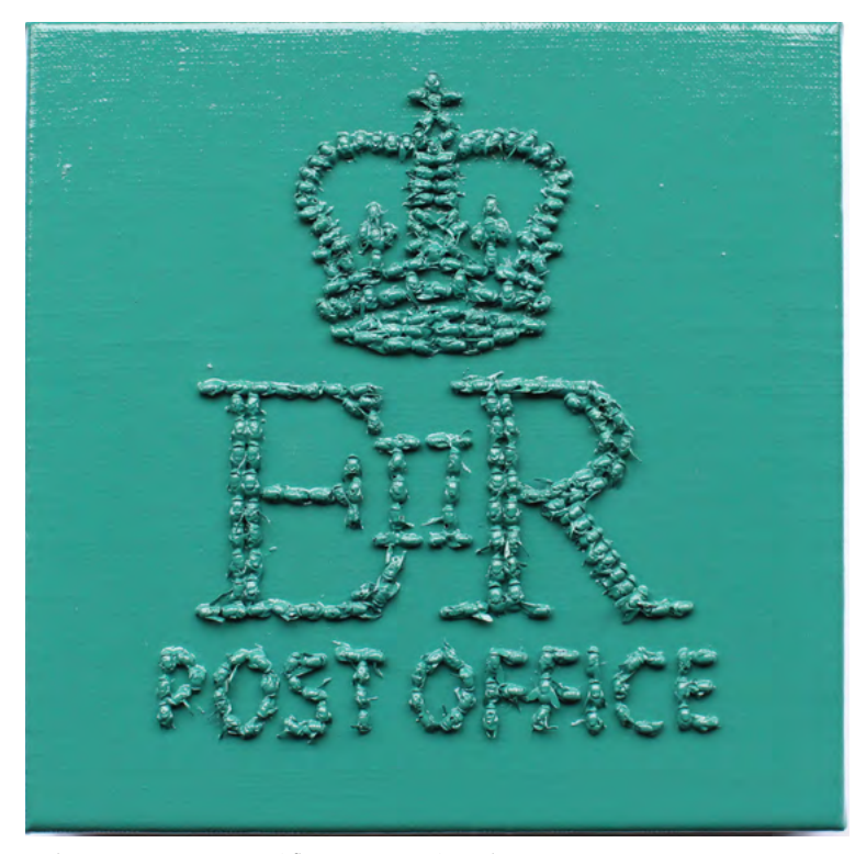
Split 3.2, 2016, Preserved flies, paint and acrylic on canvas, H228 x W228 mm 分裂3.2,2016,布面丙烯、防腐蒼蠅、油漆,長228 x 寬228 mm

《分裂3.1》:用的圖案為香港殖民地時代的郵筒上的皇冠標誌,而《分裂3.2》:用的圖案是為香港殖民地時代的郵筒上的塗上新顏色的皇冠。