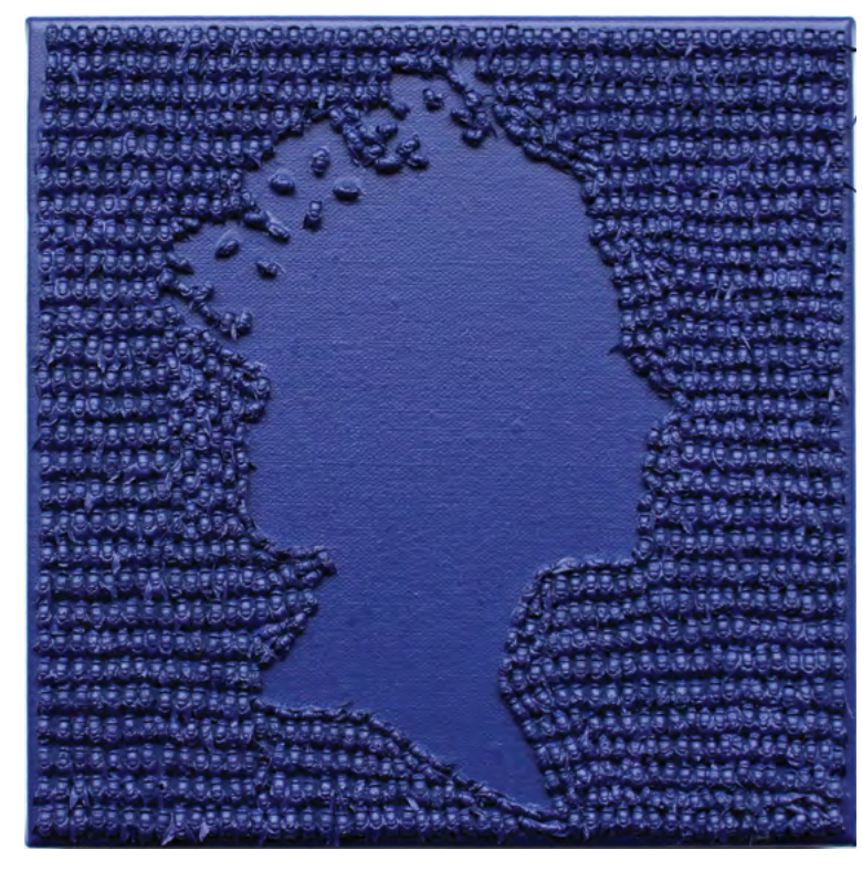
Split 2.1, 2016, Preserved flies, paint and acrylic on canvas, H228 x W228 mm 分裂2.1,2016,布面丙烯、防腐蒼蠅、油漆,長228 x 寬228 mm