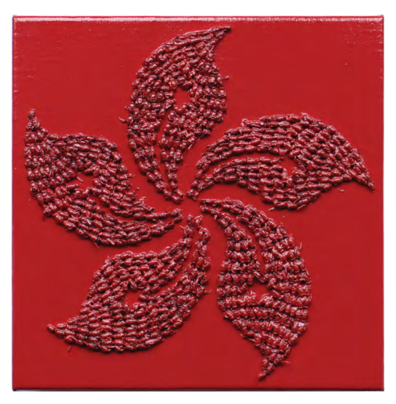
Split 1.2, 2016, Preserved flies, paint and acrylic on canvas, H228 x W228 mm 分裂1.2,2016,布面丙烯、防腐蒼蠅、油漆,長228 x 寬228 mm