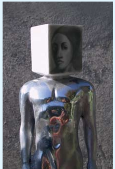
Oriano Galloni, The Man #2 (detail), 2006, aluminum and pencil on white Carrara marble 160 x 5.5 x 8 cm.

Dramatic monumental figures such as White Moon (2011) and Birth of Mars (2011) seem somehow distant from the world, like the ancient Greek gods looking down on the mortal world in an attitude of superiority. There is also here a sense