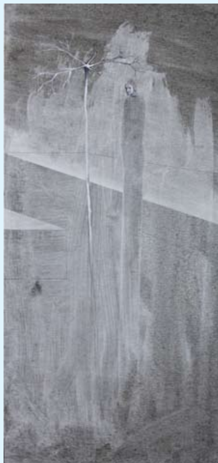
Oriano Galloni, Parallel Sensations , 2010, acrylic on plastic, 68 x 33 cm.

I moved to New York because I think that it is the place to be for art. You have