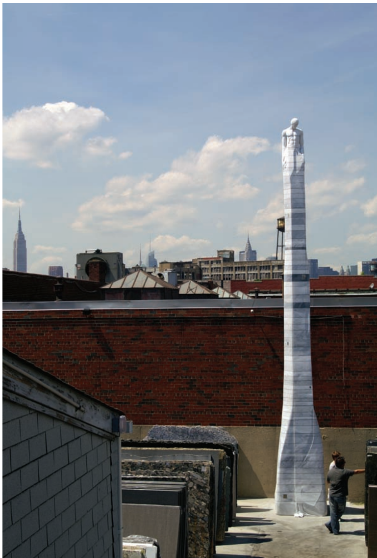
Oriano Galloni , White Moon , 2011, assembled marble and steel, 10 meters high. Photographed in the Artist's studio in New York. Previous page : Oriano Galloni , The Birth of Mars , 2010, assembled marble, 5 meter high.

a reinterpretation of traditional figurative sculpture. His paintings, however, reveal figures trapped on paper and canvas. In sculpture and painting Galloni references Western art history—especially Italian—with an ease that adds fresh grace and presence to his creations. In sculpture and painting Galloni innovates at will as he seeks to set his creations free from their earthly prisons to find their identities among the living world of art.