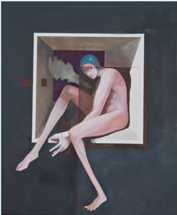
Oriano Galloni, Box of Saturn , 2010, oil, cotton on canvas, 60 x 50 cm.