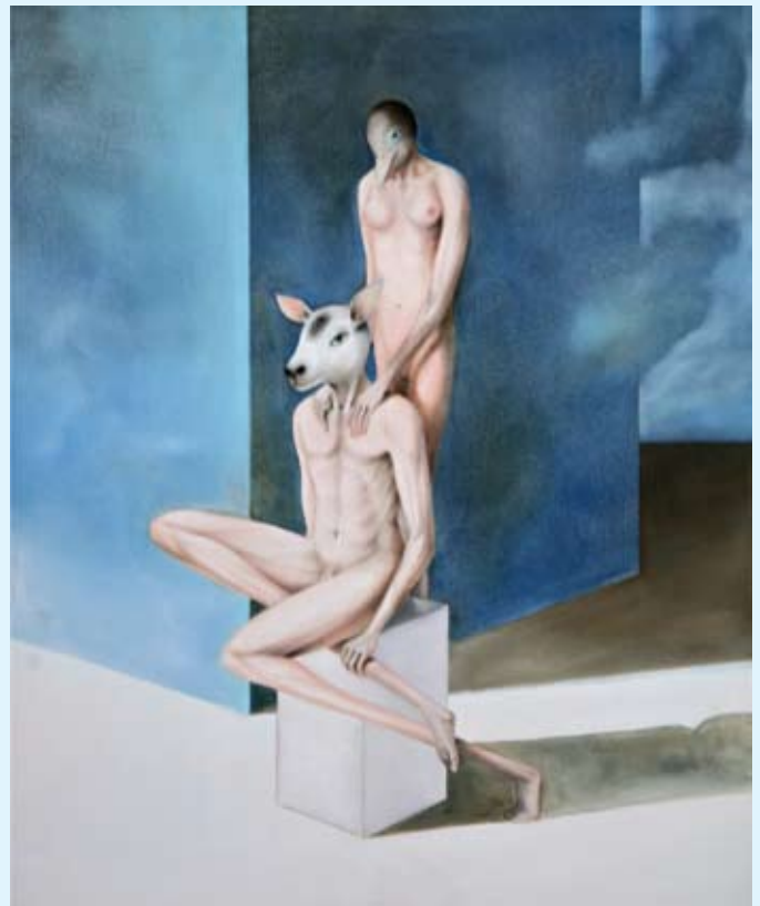
Oriano Galloni, The Bird Woman and the Cow Man are in Love , 2009, oil on canvas, 60 x 50 cm.

began to feel Africa. I began to feel the emotion of art through nature and the light. I began to feel the power of color and the energy of the light.